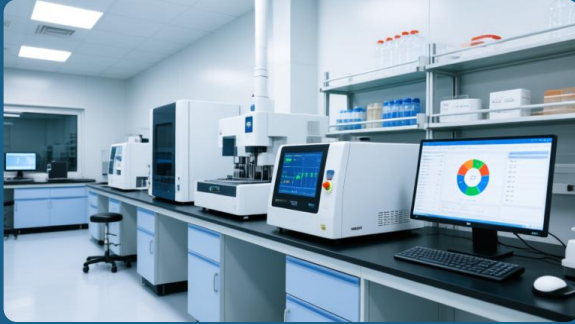
Laboratory Information System